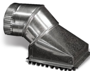
Square base takeoff shown without damper